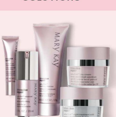
ADVANCED SIGNS OF AGING SOLUTIONS